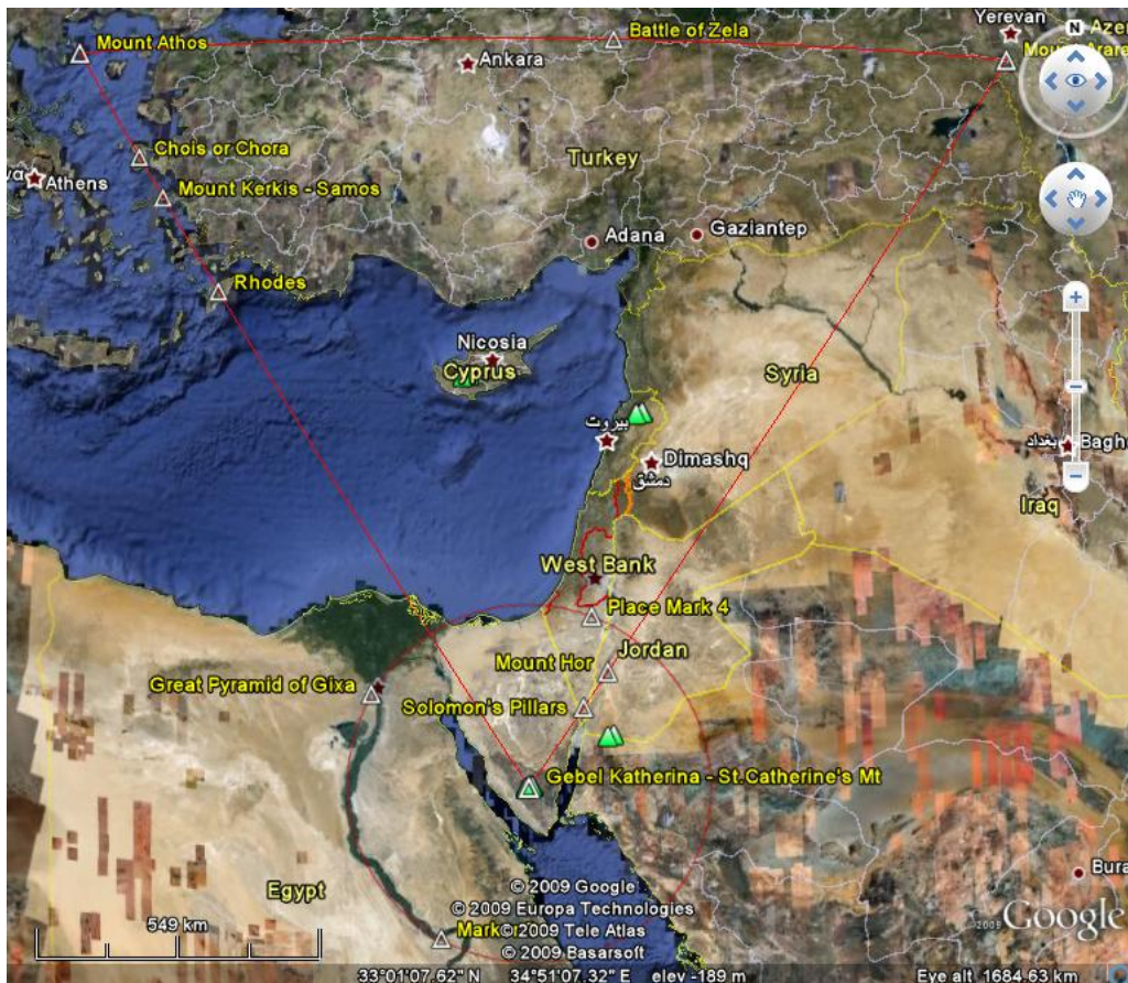
Google Earth Picture of the links between Mt Athos, Mt Ararat and Gebel Katherina. This latter site is also at the centre of a vast landscape circle that links to the Great Pyramid.

If we associate love with the heart then we might say that the heart chakra of the Mediterranean (or at least one of them) has been split. Cyprus also lies at the heart of a landscape triangle that links together the mountains of Mt Athos (Greece), Mt Ararat (Turkey) and Gebel Katarina (Sinai, Egypt). The splits going on between Greece and Turkey need to be healed and the energetic links re-balanced, for I have a strong feeling that this pattern also has an impact on the conflict between the Israelis and Palestinians.