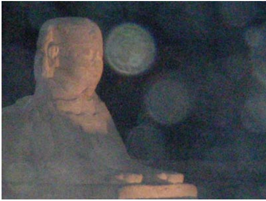
Orbs in front of a sphinx at the Luxor Temple